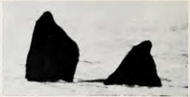
Fig. 10. An inverted whale lies motionless, holding the flippers clear of the surface. (Photo from ciné-sequence)

Subsequent interactions were initiated by the bull which approached from the rear and placed its head beneath the flukes of the partner; in one case the partner responded by rolling to lie inverted belly to belly beneath the bull, one flipper extended upright and held flat against the flank of the bull. The second erection was seen 6,0 mins after the first in an interaction which was observed from 0945 to 1025 hrs.